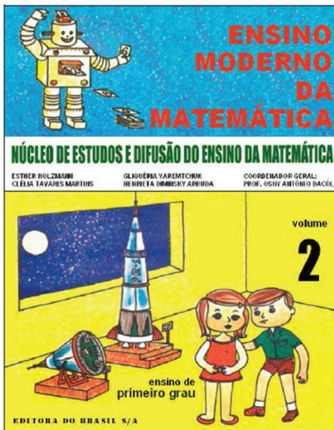
Figure 4. Cover Book of NEDEM for Primary – Volume 2. (NEDEM, 1971).

[...] in the covers of the editions for the initial years of schooling, images that allude to the technological development that was lived at that time; besides the images and the introductory texts that show the progress of technology, rocket and robot drawings are marks of the didactic publications that were produced by its members for use in schools.