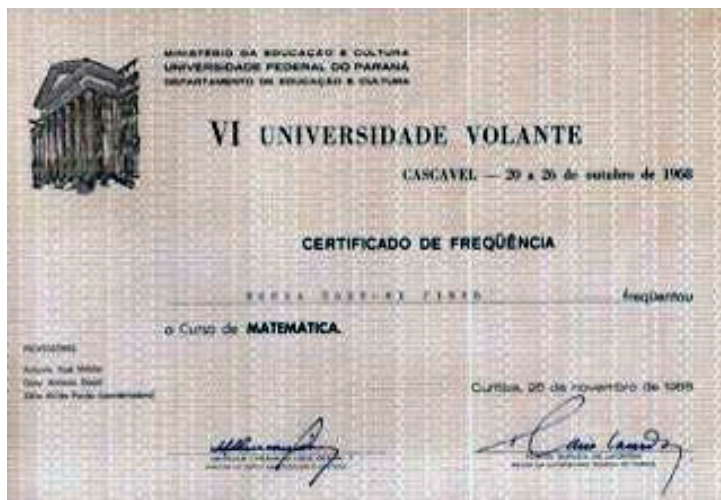
Figure 1. Certificate of the training and improvement course (Personal Archive).