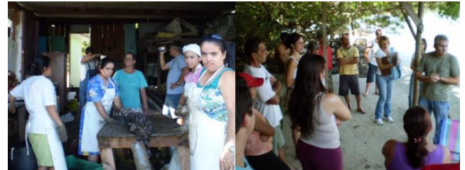
Material developed for AMPROSUL.

As future actions, the development of packaging, research concerning denomination of origin and geographic indication are previewed, as well as other forms of protection and valuation. Through the research and studies carried out, the fragility of these groups was evidenced and corroborated, reason enough that this theme has already been incorporated in future actions.