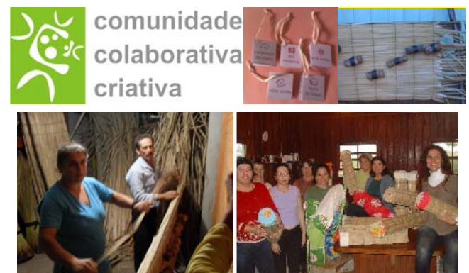
Identity developed, identification tags for products, and Taboa fiber mat. (source: NASDESIGN).

Thus, a graphic element was developed which could serve as an identity for the artisans of the region. Its concept integrated the principles of the creative communities through the suggestion for interaction among people and the local traditional communities through the reference to existing cave inscriptions in the region.