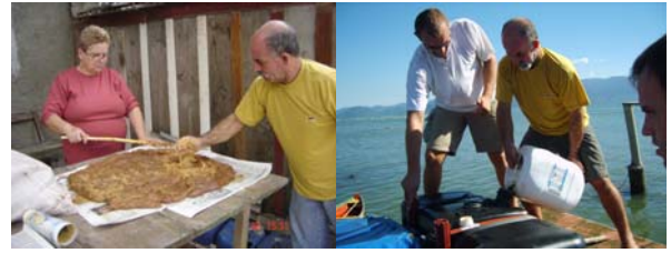
Identity and support material of the Projeto Ciclo .

In the case of recycling vegetable oil as an action, the design was applied as based upon the foundations of Design Management, with the objective to aid in the consolidation of the action: not only in defining a name, but also in the development of a visual identity and advertising materials, as well as replication of the action creating the potential for action replication in other communities. As such, it was verified that the principal problem would be in promotion and advertising, keeping in mind the lack of knowledge of the population towards the negative impacts which discarding used vegetable oil can entail.