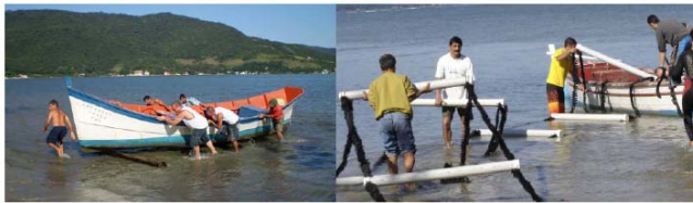
Activities of AMPROSUL.

Based upon these initial considerations, a project 6 was started to become developed in Design Management, applied to a small productive group in the aquaculture sector, preferably one demonstrating familiar characteristics. AMPROSUL is composed of 27 members, located in Ribeirão da Ilha in the south of the Island of Santa Catarina and was founded in 2005 by a group of familiarly characterized mariculturers. The predominant product in the activities of the association is the mussel ( Perna perna ), known most widely throughout the region as a mussel. Its production is initiated upon obtaining the "seeds" in the ocean through collectors. The strong point which maintains these associates united is that of "...plant together...", in the sense that the members meet in order to confection and place the collectors in the water. After a few months, they meet once again in order to remove the collectors and divide the seeds.