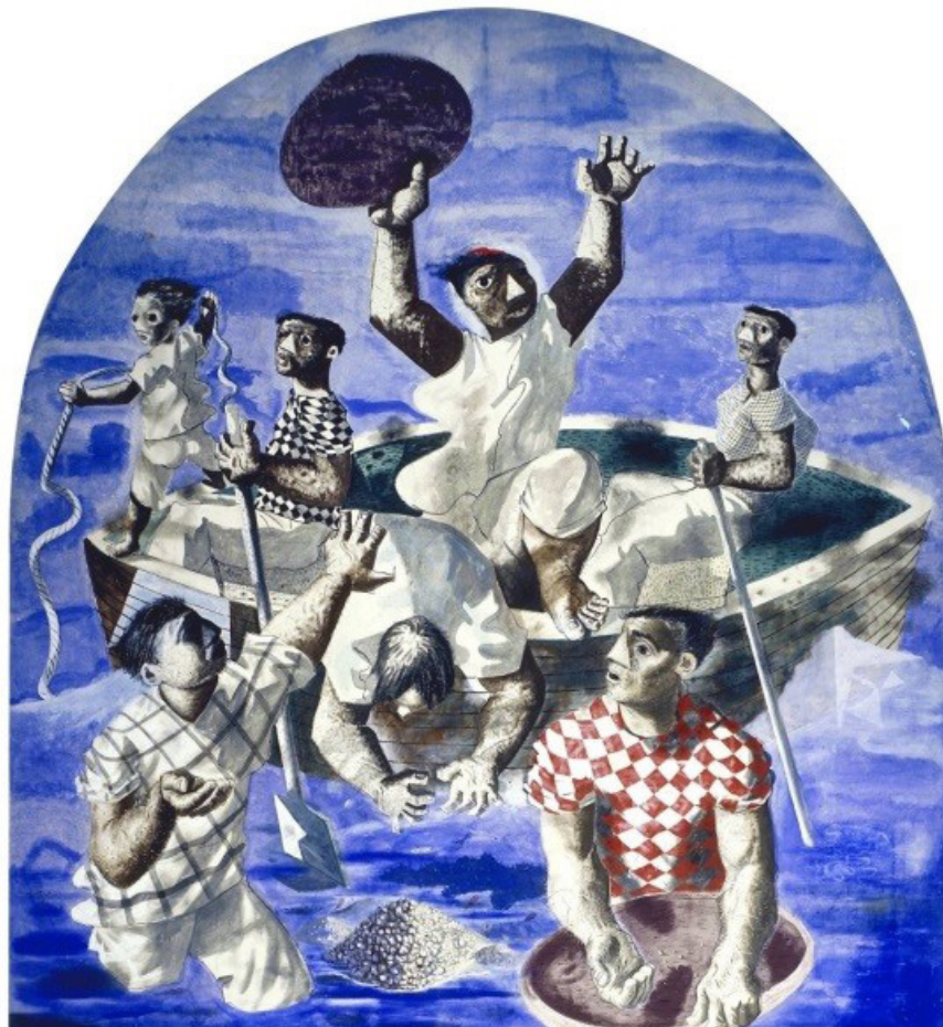
Image 8 —“Garimpo,” fresco, 1938. Gustavo Capanema Palace.

by a nineteenth century manuscript, quoted by Mello e Souza, “very well streaked of different colors, including whites, mulattos, mestizos, blacks, all poor people with such manners as is required by their unfortunate and terrible living” (SOUZA 2004, p. 281-282). Much like the case of the pioneer travels, or entradas , it is not about representing the poverty and merit of the common men of the colonization process, but also of including specific individuals and social practices, arising out of the contact between settlers and natives. Hence, including the representation of free men outside the dialectic of settlers and natives, fighting for their survival, seems to be strategic.