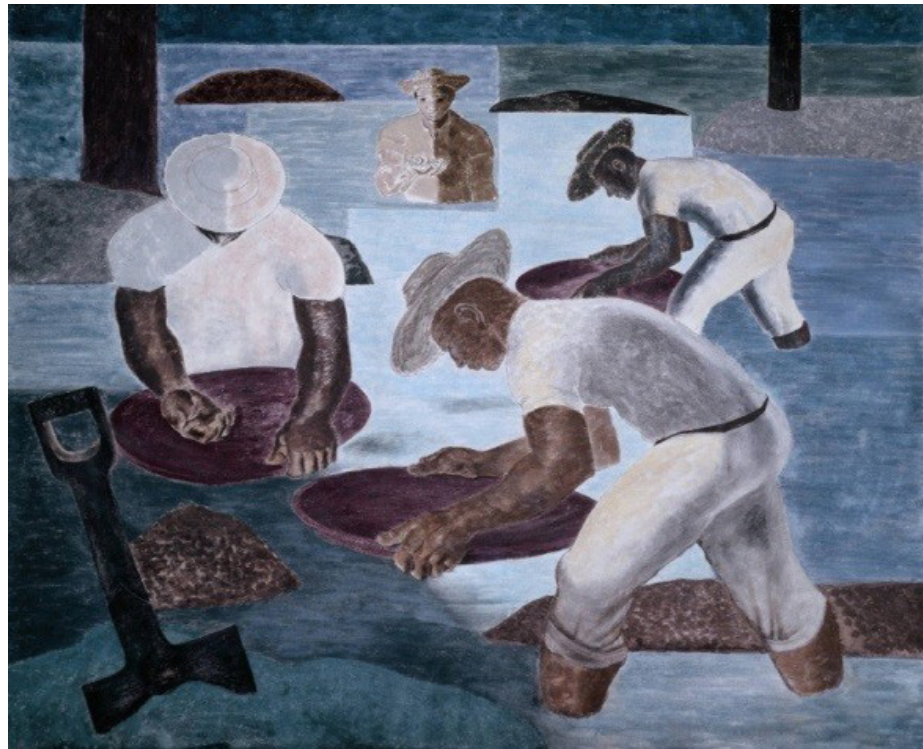
Image 9 —“O garimpo,” fresco on tempera, 1941. Library of Congress. Source: www.portinari.org.br

As has been observed by the art critics, the mining fresco may be deemed the “freer” and most anti-conventional painting of the murals (PEDROSA 1942, p. 132). Themes such as the discovery of Brazil, the Jesuits and the bandeirantes are classical historical topics of national repertoire, developed during the nineteenth century. Because of the anti-conventionalism, the relationship with Portinari’s previous work on the walls of the Ministry becomes even clearer. The difference seems to be the increased focus on the characters’ stylization and the chromatic game. Characters seem more conservative at the Ministry, or perhaps closer to the conventions of realism, and the color palette seems colder. Another substantial difference is the absence of any gesture beyond everyday work activities in the drawings of the Ministry. Such a fact once again brings Portinari closer to realist convention, for the story is told without any bias, from a distance.