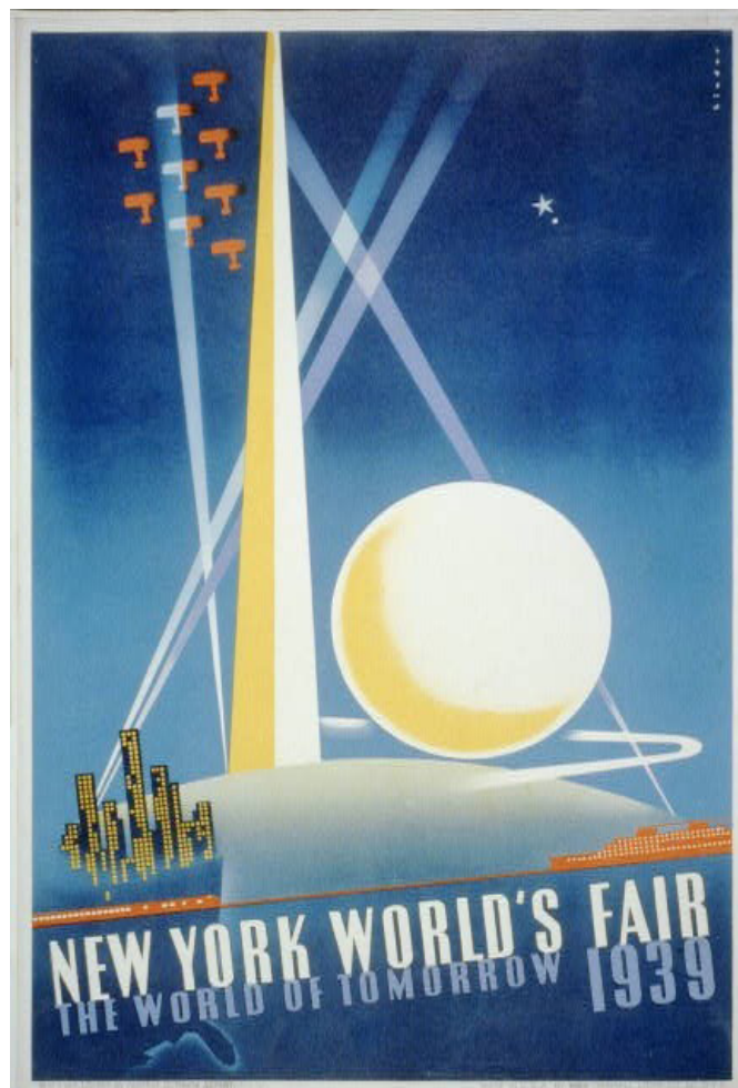
Image 2 —New York World’s Fair Poster, 1939-1940.