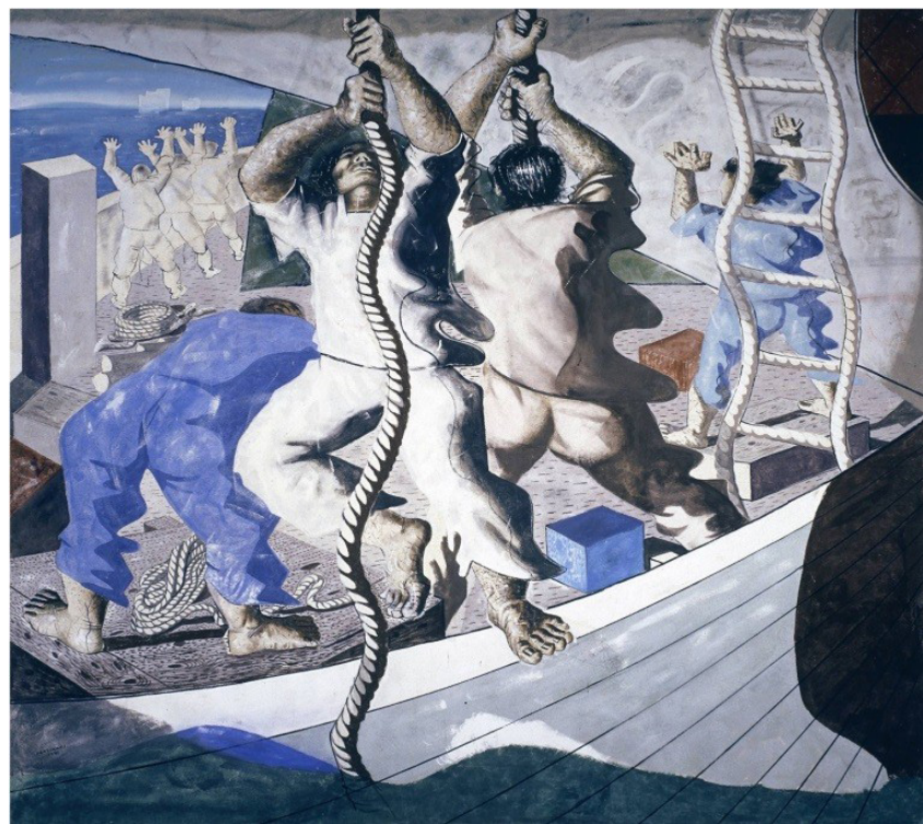
Image 11 —“A descoberta,” fresco on tempera, 1941.

One could in fact imagine the triangle formed by the integration of the figures on the center, surrounded by emotional gestures between Indians and Jesuits. Such an idea directly goes back to the Renaissance pictorial convention, whose imaginary triangle is comprised of Mary carrying baby Jesus ( maestà ) or Jesus taken down from the cross ( pietà ). However, the painting actually shows the ordinary interaction of men who perhaps are as simple as the poor workers (who are also likely to be multi-racial) on red earth, much like the ground walked upon during the bandeiras . Such interaction suggests some sort of communion in daily life, in work and in affection, which becomes even clearer when the frescos are compared to the sketches. The sketches include the image of preaching, which remits to the notion of hierarchy and control. Said environment of universal, multicultural (or multiracial) community, strongly marked by secularized religious themes, according to the modernist conventions, are precisely the leading features of War and Peace , monumental work painted at the headquarters of the United Nations, in New York, executed from 1952 to 1956.