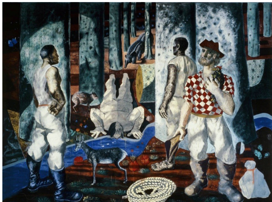
Image 5 —“Desbravamento da Mata” or “As bandeiras,” fresco on tempera, 1941. Library of Congress. Source: www.portinari.org.br

The topic of the bandeiras has an empathetic potential with the North American audience. The bandeirantes are the Brazilian pioneers. They represent the expansion of the frontiers towards the west in both cultures, and also represent the triumphant fight of man over indomitable—and, to a certain extent, unknown—nature. Such territory of the unknown has a special designation—wilderness, in the American case, and sertão , in Brazil. However, such a great empathetic potential never seem to have been achieved. The association of Brazil with the exotic, closer to the imaginary of a tropical country, went against direct comparisons between the cultures.