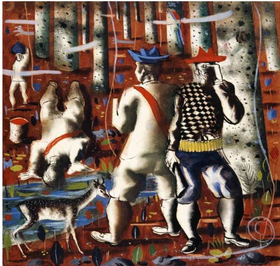
Image 7 —“Entrada na floresta,” card and tempera, 1941. Library of Congress. Source: www.portinari.org.br

This may be the only dominating white male present in all of Portinari’s works during his mature phase; all other men are either multiracial or black. The executed figure is quite different from the one