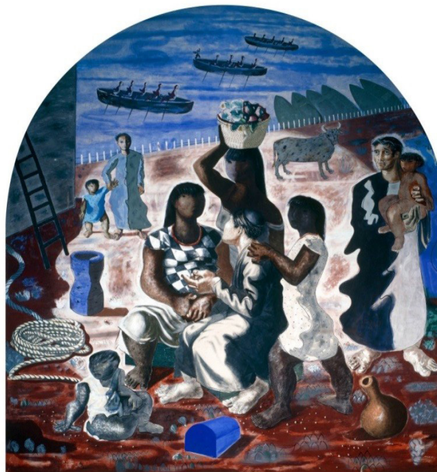
Image 10 - “A catequese,” fresco on tempera, 1941.

Representing individuals whose activities were developed at the margins of society and restoring their role in the epic saga of the history of the Americas—one should also observe how atypically the discovery of gold is represented, for there is no sign of opulence or paradise, as would be the general case for the theme represented in the painting. The reference to paradise that was never found is quite clear in this case; in other words, it is the story of triumphal failure, for this gold was not for them.