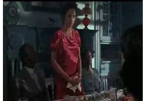
Sophia's and Squeak's turning points (Figures 6-7)