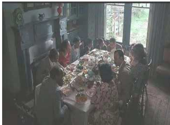
The Easter dinner reunion (Figure 1)