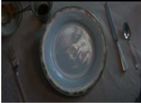
Sophia's face reflection (Figure 2)

Besides Nettie and Shug, Sophia also plays an important role in the plot composition. She has always been a strong and brave woman who does not allow men to treat her as a simple object, “like Shug she is a model of a woman who can hold her own” (Digby 160), but now she is fragile and sick due to the fact that she has, in her defence, beaten a white man and consequently has been in jail for many years.