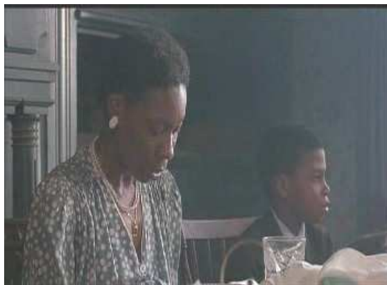
Celie’s facial expression connotes her initial subservience (Figure 3)

In this mise-en-scene, facial expressions and performance are objects worth of analysis. Celie has experienced a life of pain and exploitation, but now she is leaving her home and consequently her cruel husband Mr. Thus she is obviously apprehensive and fearful; for this reason Celie’s facial expression and her make-up connote this subservience (figure 3).