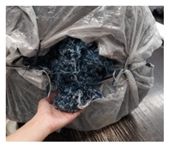
Figure 7: Denim fabric provided by the company Estopas Coelho.

Based on the arrangement of materials supplied by the partner companies, three products were chosen for prototyping, considering both the usefulness and effective use of shredded fabrics and the level of difficulty in making them, since the cooperative members who will carry out this process do not have advanced knowledge of sewing. The research team designed and prototyped three products that could use shredded material as a filling: a pillow (figure 8), a pet bed (figure 9) and a pouf (figure 10). The prototyped products will still have to undergo tests to improve aspects necessary for their production and commercialization, such as weight, dimensions, possibilities of patterns through the fitting of textile retraces, use of double lining, among others. In addition to these products, communication elements are being developed by the project team aimed at the customer segment (packaging, label, tags), and the next activities include the creation of