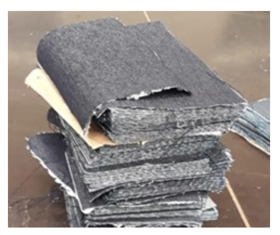
Figure 6: Denim fabric from the production leftovers of the company GMTex.