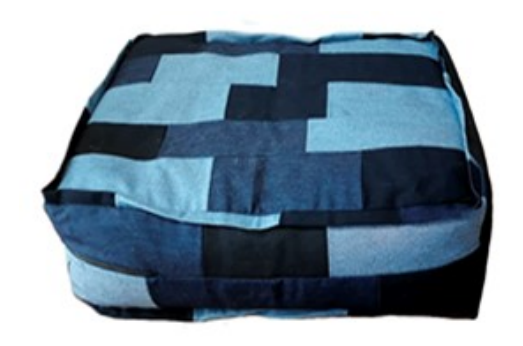
Figure 9: Dog bed prototype.