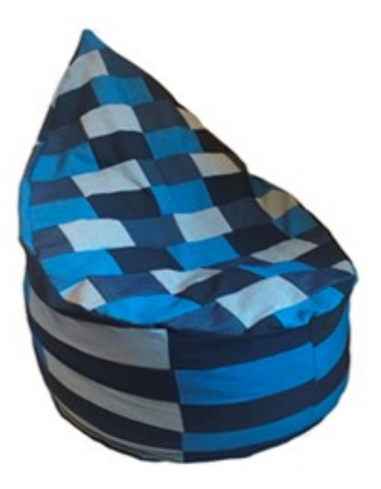
Figure 10: Pouf prototype.

In addition, a market study will be carried out in order to prospect opportunities for commercialization of these products and define the sales strategy. Another important aspect in the BRT system refers to the need to capacity the people who will operate the TWB, which will be discussed below.