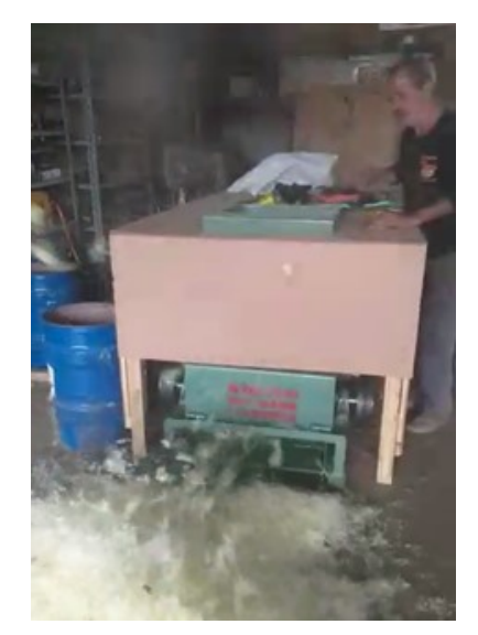
Figure 12: The fabric shredder in operation, with the protective fairing.