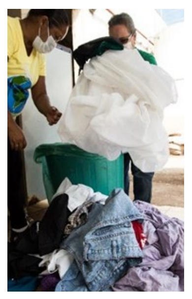
Figure 2: Cooperatives separating post-consumer garments.