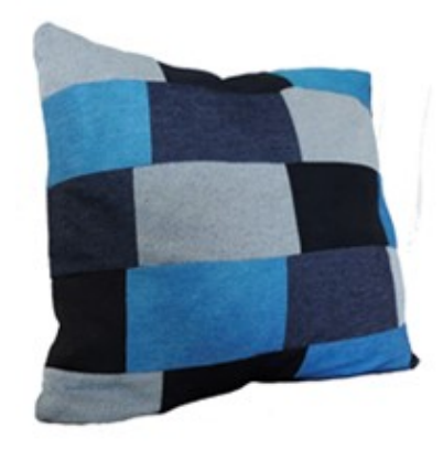
Figure 8: Pillow prototype.

communication pieces for the partnerships and cooperative members of the project.