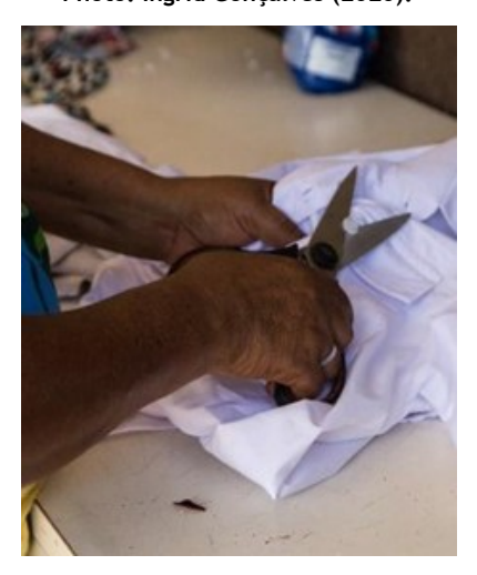
Figure 3: Cooperated disassembling a post-consumer garment.